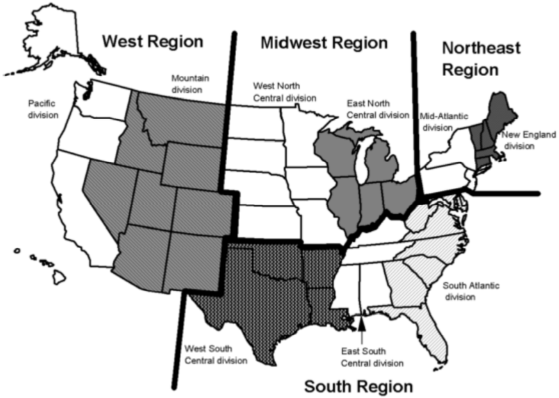
Figure C1. Census Regions and Divisions