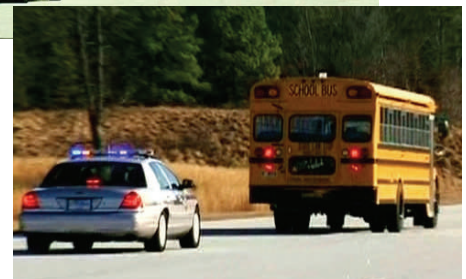
VST tests at Lauren Proving Grounds, South Carolina.